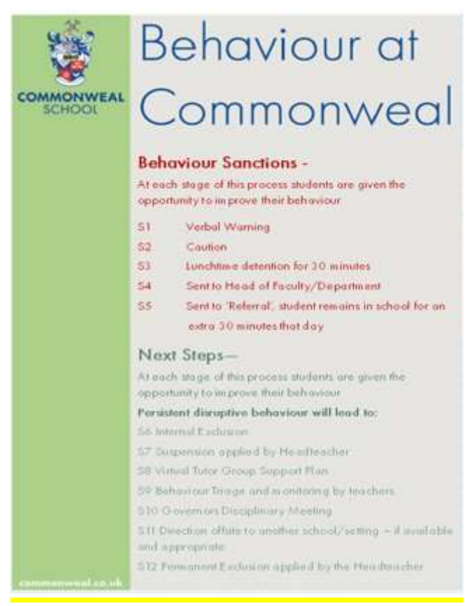
See also the school's Behaviour for Learning Policy - P25.